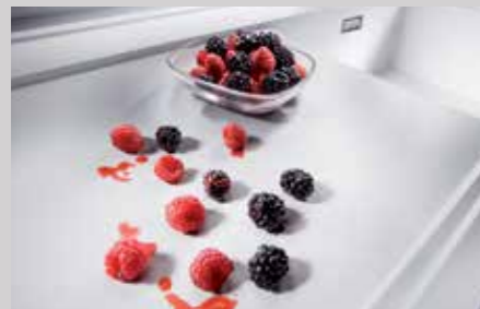
Lasting impression – not even heavily staining foods such as fruit, marks the material.

Never before has a sink centre been so easy to clean.