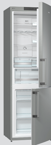
NRK 6192 JX Freestanding fridge freezer