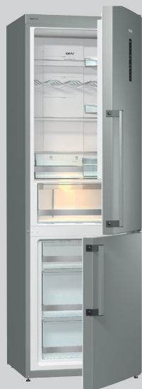
NRC 6192 TX Freestanding fridge freezer