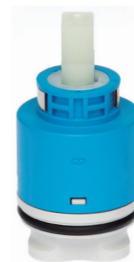
Cartridge with distributor