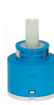
Cartridge without distributor