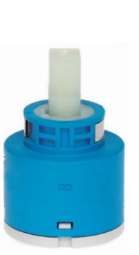
Cartridge without distributor. Specially designed for kitchen applications