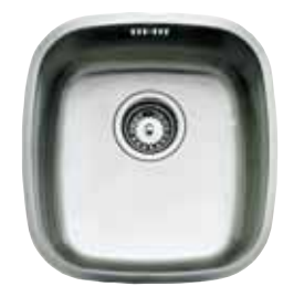
Outer dimensions: 367 × 484mm Bowl dimensions: 340 × 450 × 250mm Base unit: 450mm TOTAL €139.00