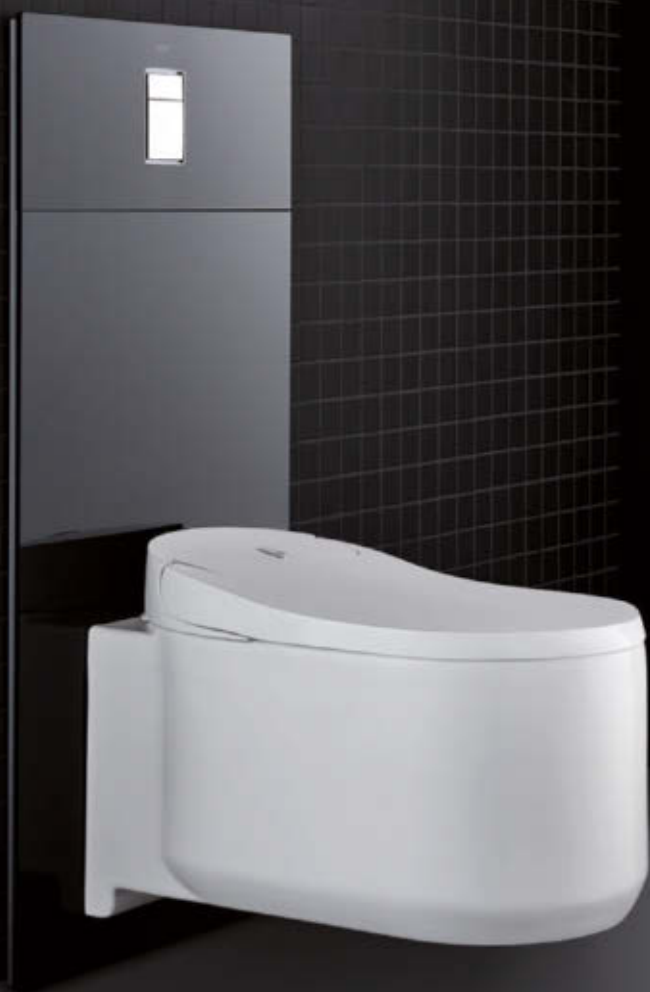
39 374 LS0 Glass Cover Skate Cosmopolitan Moon White