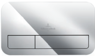
Art.-Nr.: 922490-xx Material: Plastics

The modern E200 flush plate features sleek lines and a timeless design.