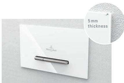
Surface-mounted (no additional parts required)

The stainless steel installation set allows the flush plates in the M300 and E300 series to be surface-mounted as well as flush-mounted.