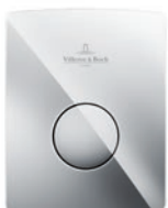
Art.-Nr.: 921944-xx Material: Plastics

The 3 urinal flush plates blend perfectly with any bathroom style thanks to their sleek design and when combined with the toilet flush plate they give the bathroom a very attractive overall impression.