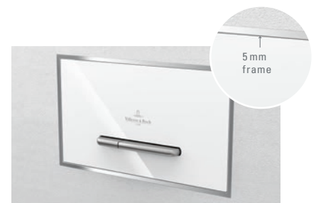
If required: 922158LC distance frame (5 mm) for covering uneven tile joints