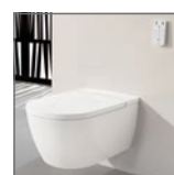
ViClean Villeroy & Boch