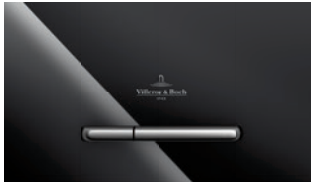
Art.-Nr.: 922160-xx Material: Glass

COLOUR VARIATIONS (FLUSH PLATE/PUSH BUTTONS)